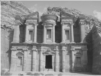
Petra, Jordan - "The Rose Red City"

The city was first established in 312 BC; making it one of the oldest metropolises in the world.