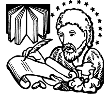
St. Matthew

At the time he was called to be an Apostle by Jesus he was working as a tax collector. He wrote his Gospel which was addressed to the Jews after Pentecost. Immortalized by Caravaggio he more than likely died of natural causes.